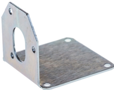
Pt. No. 727 Geared motor bracket (90 degree)