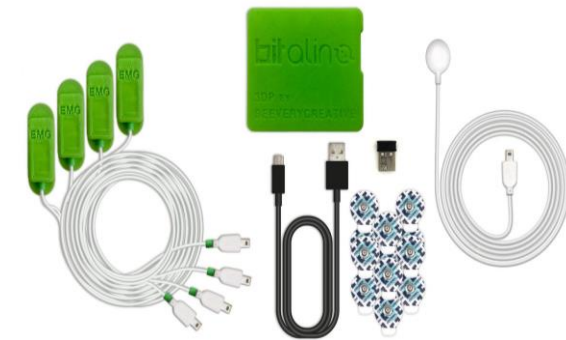
Fig. 1 MuscleBIT bundle.

The BITalino MuscleBIT bundle is designed for everyone who wants to measure muscle activity by evaluating electromyography (EMG) signals. This bundle is completely assembled with our 3D Printed Casing for BITalino (r)evolution Plugged making it more convenient to use, wearable, sharable & transportable. The four Assembled Electromyography (EMG) Sensors with SnapBIT-DUO allow repeatedly accurate & fast measurements, once the user can benefit from the pre-fixed electrode distance, 1-lead cable for each sensor (instead of 2-lead or 3-lead cable) and one reference cable for all sensors connected.