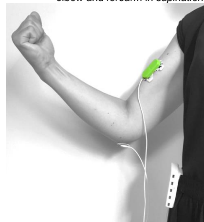
Fig. 4. Example electrode placement of the assembled version along the muscle fibers.